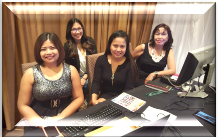
AGA Guam Chapter Volunteers—Tabulators for the Miss Earth-Guam Beauty Pageant held on March 7, 2016